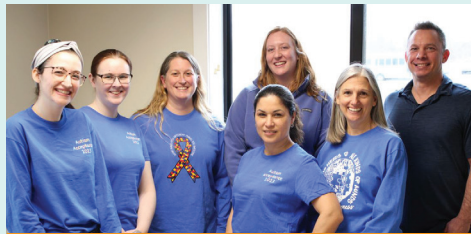
To kick off Autism Awareness Month, our staff members gathered for a photo at the agency's Eberhardt Center on March 31 wearing blue shirts in support of Autism Services at The Arc Ontario.