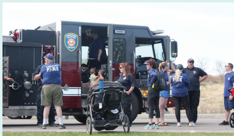
First responders from Cheshire Volunteer Fire Department showcased one of their firetrucks during our Autism & First Responders Family Event on April 15.