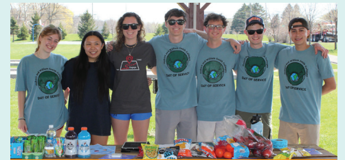
Volunteers from Hobart and William Smith Colleges joined us for an Autism & First Responders Family Event hosted by The Arc Ontario on April 15 at Richard P. Outhouse Memorial Park.