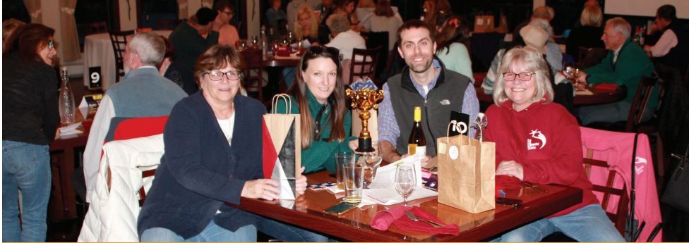
Team Taking Care of Quizness, comprising of current and former staff members at The Arc Ontario, took home the first place trophy at our annual Trivia Night fundraiser held on March 31st at Clifton Springs Country Club.

held at Clifton Springs Country Club! This fun-filled event raised over $1,000 to benefit The Arc Ontario's growing menu