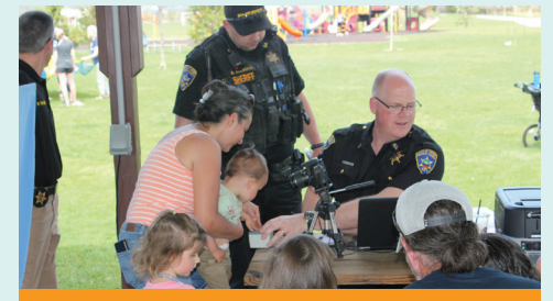
Officers from the Ontario County Sheriff's Department also joined us for the event, taking fingerprints for Project Lifesaver and Operation Safe Child, initiatives designed to promote child safety.