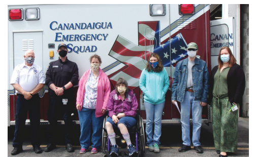
Individuals from Ontario ARC's JET Connections Program and members of Canandaigua Emergency Squad after spending a day volunteering together.

valuable, firsthand job skills and training opportunities that will help the individuals we support achieve their goals. Stay tuned for more JET Connections adventures! ✨