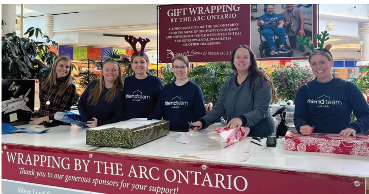
Volunteers from The Friend Team gave the gift of their time this holiday season and joined us at our Gift Wrapping Booth fundraiser at Eastview Mall.

Stay tuned for more upcoming events at The Arc Ontario. You can follow the latest happenings at the agency by monitoring our website and social media pages. Many thanks to everyone who came out to support our fundraising events. We look forward to seeing you all again soon! ✨