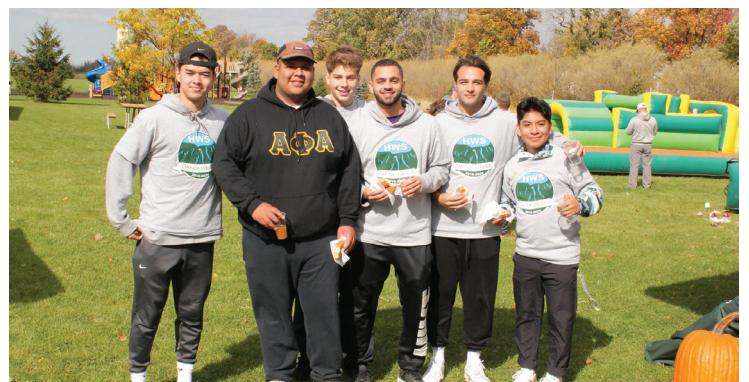
Volunteers from Hobart William Smith College joined us on October 15 for a fun-filled morning at our Annual Harvest Fest fundraiser.