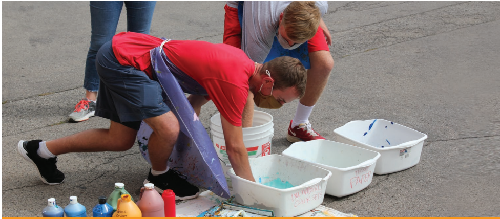
Project SEARCH participants created a beautiful piece of art in a courtyard area of the mall to celebrate the official launching of Project SEARCH at Eastview Mall.