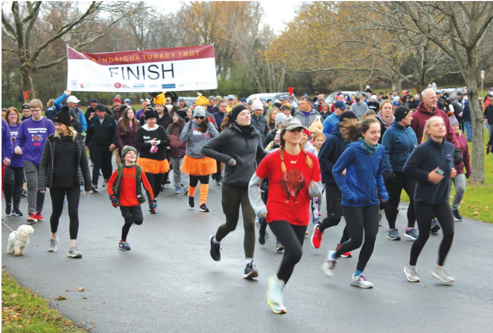
Over 400 runners participated in the 12th Annual Canandaigua Turkey Trot, Ontario ARC's first in-person fundraiser in two years.

of innovative programs and services for people with intellectual and developmental disabilities or other challenges. This was our first in-person event in nearly two years, and we were thrilled to see our friends, old and new again! We are grateful for the continued support from our community partners and we look forward to seeing you again next year. ✨