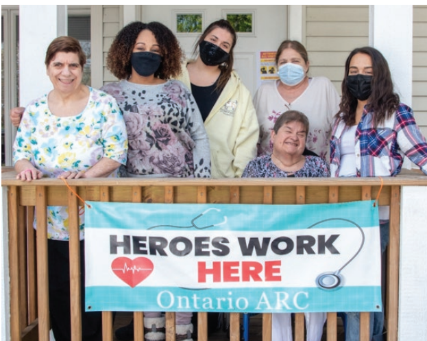
Staff members and residents at Ontario ARC's White Springs Road residential home.